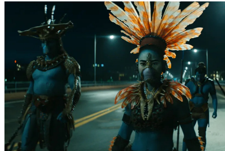
Attuma and Namora are Namor’s advisors who fight alongside the Talokan king.